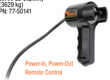
Power-In, Power-Out Remote Control

8,000 LB Capacity (3629 kg) PN: 77-50141